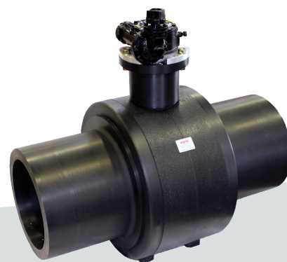
16" valve with gear operator

For additional information visit www.broen.us or check the dedicated product brochure