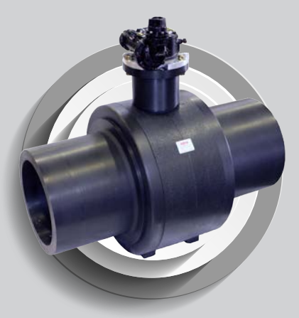
16" valve with gear operator