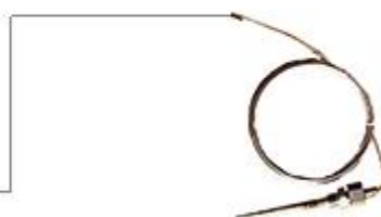
TRANSMITTER 4-20 mA