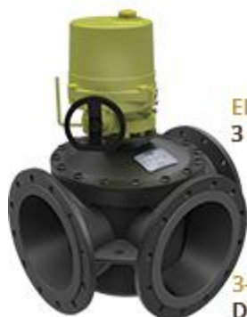
ELECTRIC ACTUATOR 3 POINT, ANALOGUE