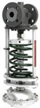
PRESSURE REDUCING VALVE DN 15 - DN 80