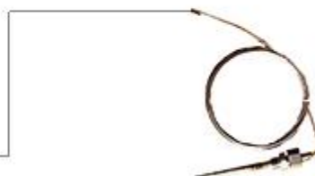
TRANSMITTER 4-20 mA