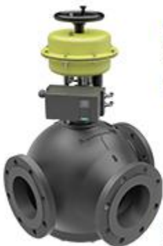
PNEUMATIC ACTUATOR SPRING CLOSE/OPEN PNEUMATIC POSITIONER