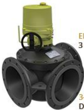
ELECTRIC ACTUATOR 3 POINT, ANALOGUE